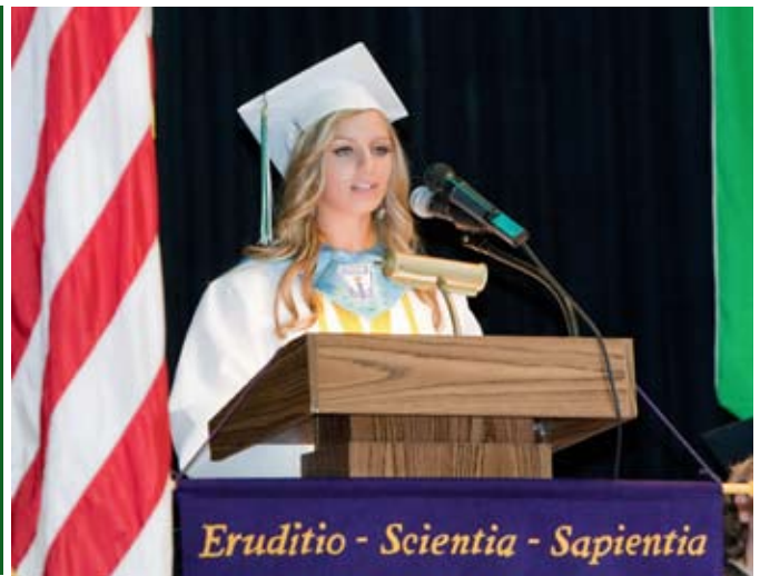
Eruditio - Scientia - Sapientia